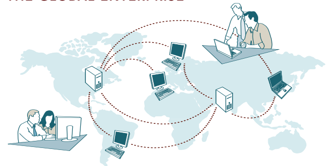
Digital Guardian's IP Solution Pack Makes It Easy to Protect Information Shared With Employees, Customers, and Partners Around the World.

Protect Confidential Documents: Prevent the unauthorized copying and/or transfer of proprietary documents and other files containing confidential information.